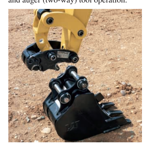
Mechanical Quick Coupler. The Cat Quick Coupler makes frequent tool changes fast and easy. Compatible with all Cat Mini Hydraulic Work Tools, it features a strong, lightweight, low profile design with no debris traps for years of secure work tool changes.