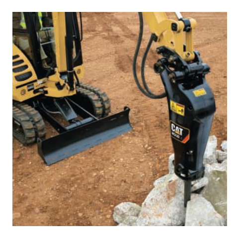
Auxiliary Lines and Connectors. The auxiliary lines and connectors are fitted as standard, meaning the Cat 302.5C comes ready to work, enabling both hammer (one-way) and auger (two-way) tool operation.