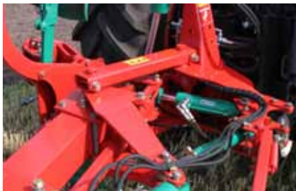
Optional hydraulics with memory system