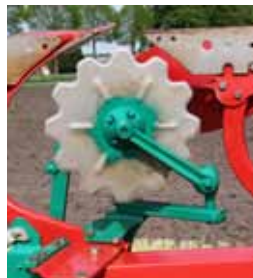
Maize or manure skimmers. Notched disc or plain disc Ø 18" / 20"