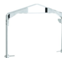
2 Lifting bail for FS 400 series