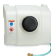
1 Water tank kit for FS 400 series