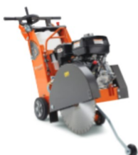
FS 400 LV