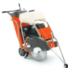
FS 410 D