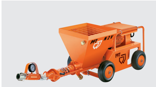
PFT N 2 V

PFT N 2 with pump tube F 2 and flexible hose with delivery hopper.