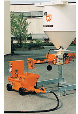
Connection with PFT HM 104