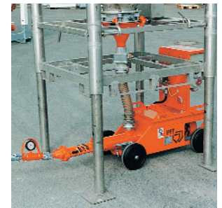
Connection with PFT MULTIMIX