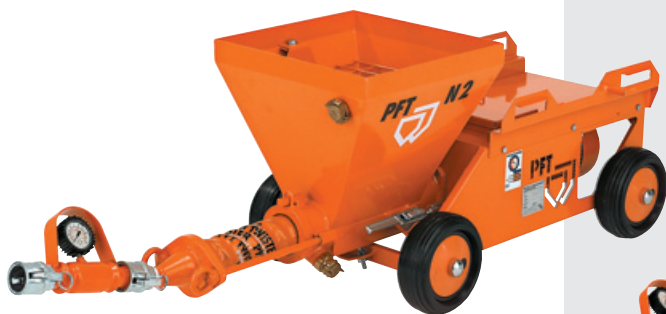
PFT N 2 FC 400