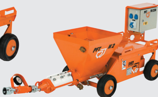
PFT N 2 FC 230