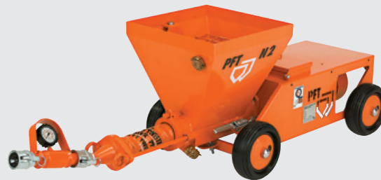
PFT N 2