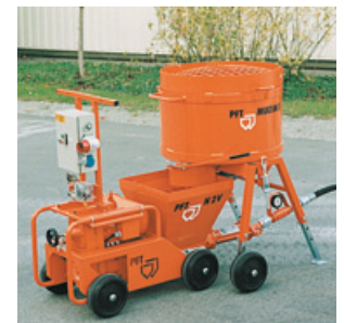
Connection with PFT MULTIMIX